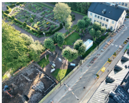
Figure 8. The reconstructed Linnaeus Garden and private home of the Linnean family in Uppsala, with the excavation in the left corner of the picture.

mial classification system for plants and animals). In 1741, Linnaeus was installed as Professor of Medicine and Botany at Uppsala University and subsequently, he and his family moved to the newly renovated Prefect accommodations adjacent to the likewise renovated botanical garden (figure 10). The renovated botanical garden was designed based on Linnaeus's new classification system and organised after the seasons. In the back of the garden, a modern orangery had been built for cultivating and preserving exotic tropical plants.