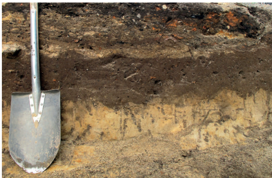
Figure 2. A cross-section of occupational layers containing buried garden soil from an excavation in the town of Norrköping, Östergötland. At the base of the cross-section, within the yellow sand, traces of earthworm activity and root growth are visible. Above this, the brown homogenised buried garden soil can be seen. In the interface between the sand and the subsoil, distinct traces indicate that the garden soil was cultivated using spades.

Lindeblad & Petersson 2009; Lindberg & Lindeblad 2013:79; Lindeblad & Nordström 2014). This method has been developed with the understanding that garden and horticultural remains differ significantly from those of buildings, streets, waste deposits, and conventional occupational layers. Garden soils are typically formed over an extended period and are often largely homogenised due to repeated cultivation. As a result, cultivation layers frequently lack distinct stratigraphy and/or visible structures (figure 2).