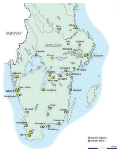
Figure 1. Map of the southern parts of Sweden showing where garden features and plants have been identified through archaeological excavations in medieval and early modern towns. Illustration: The Archaeologists, National Historical Museums.

In this branch of garden archaeology, methods, analyses, and questions have been inspired by Scandinavian landscape and agrarian archaeology, as well as British and American garden archaeology. The objects of research and research questions are constantly broadened, and the latest excavation methods and analyses are used. One example of an important development is the systematic use of archaeobotanical analyses as an integrated part of the excavations (Currie 2005; Lindeblad 2006; Lindeblad & Petersson 2009; Heimdahl 2010; Gleason 2013; Lindeblad & Nordström 2014).