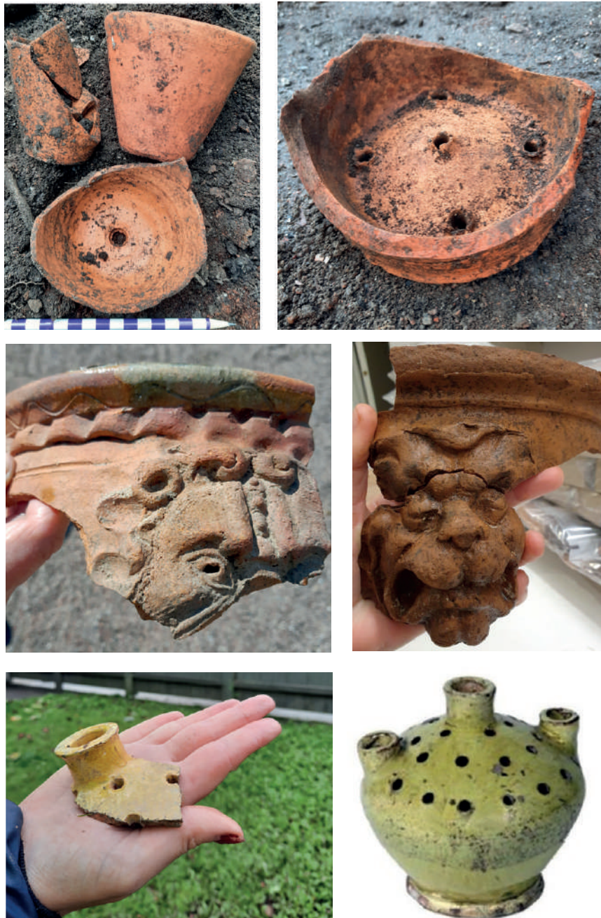
Figure 10a: Examples of planting pots from the Linnean household (left) and planting pots from Frisens park (right). 10b: Two urns from the Linnean household. To the left, a large urn with a Medusa head. To the right, an urn decorated with a lion head. 10c: The sherd of a yellow tulip vase found during the excavation (left), and the exhibited tulip vase in the Linnean museum in Hammarby, just south of Uppsala, to the (right).