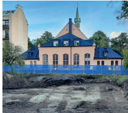
Figure 7. One of the garden quarters, where white sand was laid out, most likely to create a contrast to the darker paths and cultivation beds.

The excavated garden was located in the Rosendal quarter, on the outskirts of 17th-century Stockholm, and was owned by a vicar in the latter half of the century. He was a highly prestigious individual, serving as the priest to the court and queen (Hållans Stenholm & Lindeblad 2023). The garden remnants in Rosendal appear to be unique within a Swedish urban context due to their complexity, variability, and exceptionally diverse and well-preserved archaeobotanical material. Plant residues, as well as finds related to fertilisation and soil improvement, were abundant. These discoveries significantly contributed to understanding the varieties of cultivated plants and