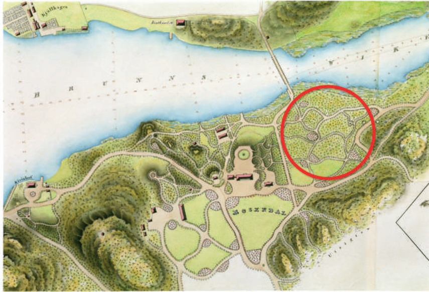
Figure 5a: A historic map from 1834. The red ring highlights the location of the Pleasure ground. Map from the Land Survey.

responded with their placement on the 1834 map (figures 5a and b).