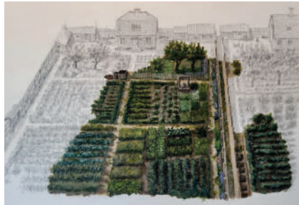
Figure 6. Reconstruction of the garden based on the archaeological results. Jens Heimdahl, The Archaeologists, National Historical Museums.

the Riddaren block on Östermalm, where the terraced garden was dated to the 18th Century (Lindeblad & Hållans Stenholm, in manuscript). Smaller excavations have also been conducted in garden settings, including Piperska Trädgården on Kungsholmen and Björns Trädgård near Medborgarplatsen on Södermalm (Dyhlén-Täckman 2020).