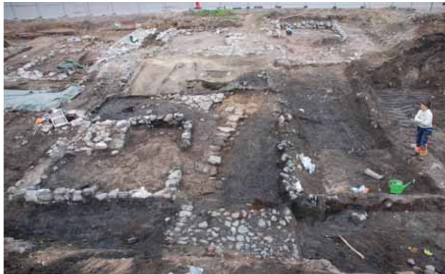
Figure 3. The smithy on plot no. 284.

In a register from 1742 Hallberg is identified as a blacksmith in the countryside outside Kalmar, but in 1750 he was counted among the master blacksmiths of Kalmar. These sources don't deliver any waterproof evidence of Anders Hallberg's whereabouts, but they definitely indicate that he lived in Kalmar many years before he moved to plot no. 284. There seems thus to have been a time lap here between the building of the forge and the presence of a blacksmith living on the same plot.