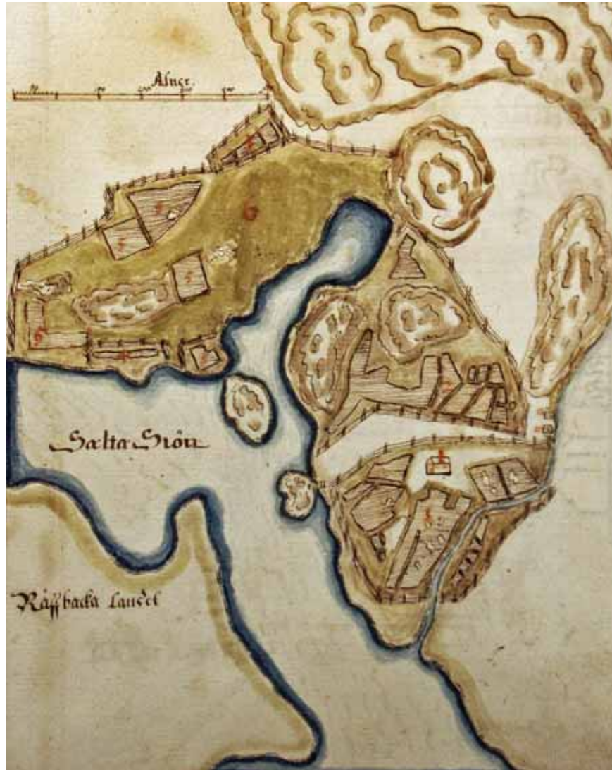
Figure 1. Kårböle, a single farm or a former hamlet in Tenhola parish, Uusimaa (Swe. Nyland), Finland, on a map drawn by Hans Hansson in 1647. In the NW one can still see that a meadow as well as some fields of a deserted medieval hamlet called Gullböle are still in use by the neighboring hamlets.

Land surveyor Hans Hansson mapped several hamlets in the Parish of Tenala (Fi Tenhola) in 1647. One of