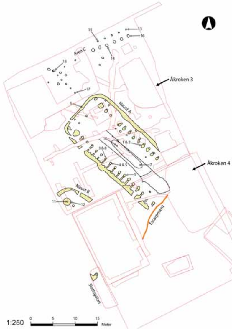
Fig. 1. Overview. Opaque lines represent excavation areas, disturbances, test trenches and modern buildings. The numbers display features sampled for radiocarbon dating (cf. tab. 1). Graufelds & Westberg 2013.

of Södermanland as a whole. The more well-preserved building (A) is furthermore the largest known naust from the Vendel and Viking period in eastern Scandinavia.