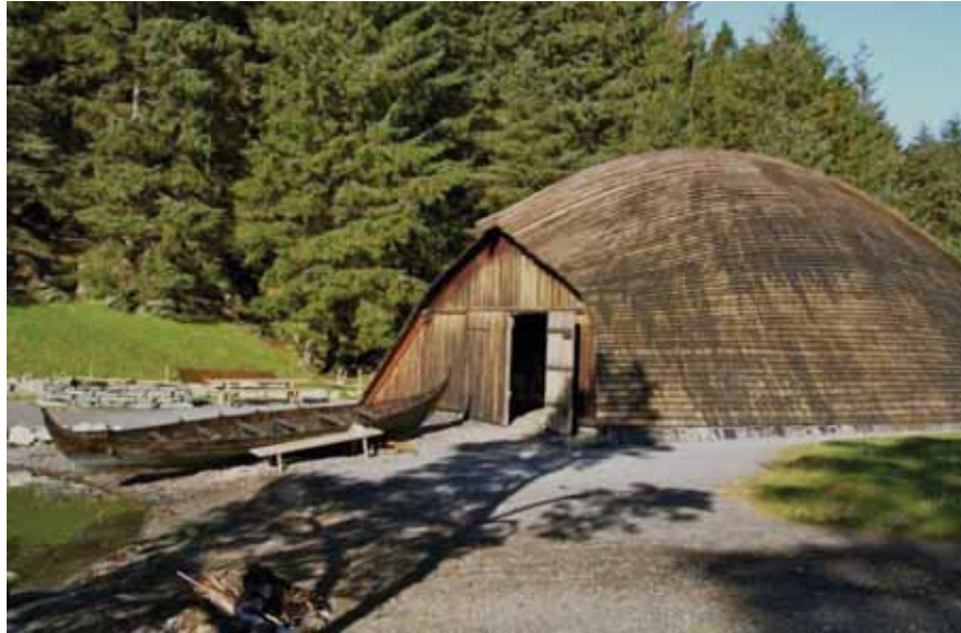
Figure 4. Reconstructed naust at Avaldsnes, Nordvegen Historiesenter. Used with permission.

ning from the trench to the posthole was 0,9 meters long and 0,6 meters wide. The posthole was 0,3 meters in diameter and ca 0,7 meters deep. To render the measurements of naust B, an extrapolated line from its short side in Åkroken 3 to the trench encountered in Slottsgatan was drawn resulting in a measurement of 17,5 meters in length and an outer width of ca 15 meters. The interior measurement between the roof supporting/wall posts was 7,5 meters. The total length of naust A, from the trench at the gable-end in the northwest to the tip of the draw-trench/landslide scar in the southeast, was 27,2 meters. Even if the southern part of the building was destroyed it is not likely that it originally was much longer, since this would place it too close to the water (see further down). It had an