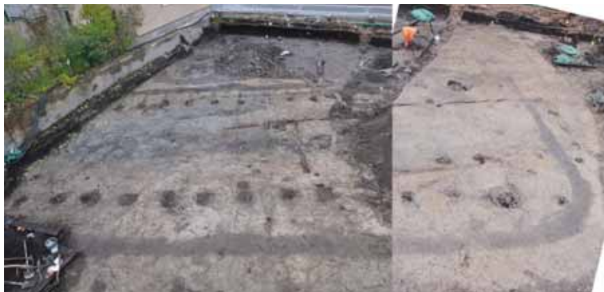
Figure 2. Merged photographs of naust A. The building was excavated in two sections in Åkroken 3 due to dump-management. The southeastern part of the building was situated underneath the wall to the left in the picture within Åkroken 4. Photo from the northeast. 2010 RAÄ Uv Mitt.

0,3-0,7 meters in depth and they contained 0,02-0,1 m 3 of rounded stone material as support. The variations in depth depend on damage done by modern disturbances. Several results from the wood-analysis conducted on wall posts found in situ proved that they also were of oak. The southwestern long side of naust A had, compared to the opposing one, a slightly different constitution. Here, only a single row of wall postholes was encountered. However, at the majority of the postholes there were, from the enclosing trench to the former perpendicularly running smaller furrows. The furrows were 0,5-1,2 meters in length, 0,2-0,3 meters wide and 0,1-0,2 meters in depth. These have been interpreted as being imprints or cut furrows for hosting horizontally placed logs on which angled supports similar to buttresses were erected and fastened on the outer side of the roof supporting wall