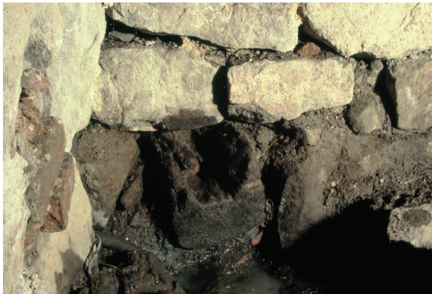
Figure 4. Wastewater management and placement of sewers was considered in the planning and construction of buildings, too. A masonry building from the 15th century was provided with a timber sewer leading the waters to the gutter of the adjacent street (Seppänen 2012b, p. 882, original photo: The Aboa Vetus & Ars Nova Museum, Turku).

vealed some evidence about sewers in medieval contexts. The oldest sewers of Turku were probably connected to the two aforementioned brooks running in the central town area. There are no exact datings available, but constructions have been roughly dated to the period when the town was founded in the turn of the 13th and 14th century and they have been connected with a need to control the dampness of the area. There is more evidence about sewers from the contexts of the 14th and 15th century although the constructions themselves have not been dated. It is quite likely, that sewers have been used for many decades, even for the whole medieval period from the 14th century until the early 16th century. Some of the med-