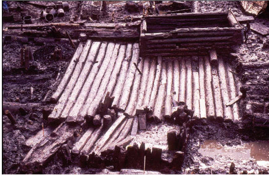
Figure 6. In Mätäjärvi quarter, a yard between two buildings was carefully paved with logs in the 1400s. The pavement covered an area of 43 m 2 (Seppänen 2012b, p. 359–365).

phase the square was unpaved. However, the square was provided with a stone paved lane lined with thick logs on both sides. The lane was 2.5 m wide equalling the width of smaller streets in the medieval Turku. In the late 15th century, the stone lane was replaced by a narrower brick lane framed with thick logs likewise its predecessor. Some of the bricks used for paving were profiled and originated possibly from the cathedral nearby (Fig. 7). The new passage was probably made after the fire in 1464, which caused severe damage to the cathedral and launched larger reconstruction activities in this area. The unpaved part of the square surface was covered with the remains of wooden dishes and other wooden material as well as with leather waste and broken artefacts