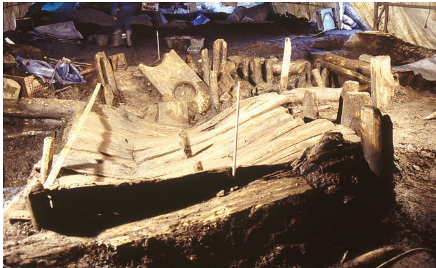
Figure 3. This timber framed privy found in Turku was built at the end of the 14th or early 15th century. The size of the privy was c. 5 m 2 and it contained a seat meant at least for two people. The privy was probably emptied prior to its abandonment at the end of the Middle Ages since the soil inside did not contain manure (Seppänen 2012b, p. 432).

Besides latrines, medieval sanitation and especially personal hygiene are often combined with the availability of privies in urban environment. In many studies, latrines are equalled with privies, since quite often they were used for the same purpose and it might be difficult to distinguish any difference between these constructions. If conclusions about the sanitation in the medieval Turku were made exclusively on the basis of the frequency of privies, we would have to admit that the sanitation