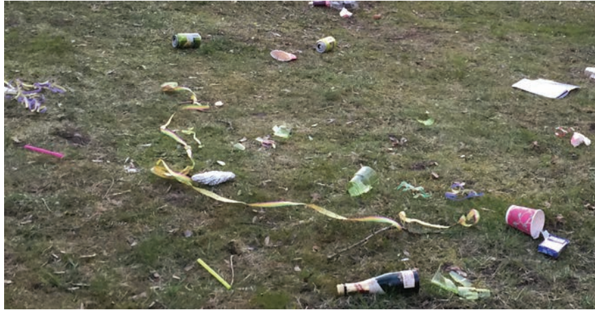
Figure 8. Conceptions of waste are time and culture bound. If one arrived in Turku on the first of May, (s)he would get a completely different image about the manners of the people and sanitation of the town than in other times. Every year, despite organised waste management and instructions, the traces of celebration can be seen everywhere until they are cleaned with extra effort and costs.

However, based on available material and studies, it seems that there were actions and practises related to organized and systematic waste management from the late 14th and early 15th centuries onwards in Turku. The organized sanitation was probably catalysed by new ideas, legislation, population growth and intensified activities in the urban sphere. New ideas about sanitation were not, however, necessarily connected to population growth everywhere. James Deetz, who studied three cities from the 18th century, discovered that all cities adopted new ideas related to sanitation simultaneously regardless of the size, situation or social status of the cities (Deetz 1996, p. 171–174). Deetz's study demonstrates that changes in sanitation can be connected with mental and attitudinal changes rather than with the