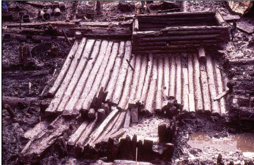
Figure 6. In Mätäjärvi quarter, a yard between two buildings was carefully paved with logs in the 1400s. The pavement covered an area of 43 m 2 (Seppänen 2012b, p. 359–365, original photo: The Museum Centre of Turku.).

phase the square was unpaved. However, the square was provided with a stone paved lane lined with thick logs on both sides. The lane was 2.5 m wide equalling the width of smaller streets in the medieval Turku. In the late 15th century, the stone lane was replaced by a narrower brick lane framed with thick logs likewise its predecessor. Some of the bricks used for paving were profiled and originated possibly from the cathedral nearby (Fig. 7). The new passage was probably made after the fire in 1464, which caused severe damage to the cathedral and launched larger reconstruction activities in this area. The unpaved part of the square surface was covered with the remains of wooden dishes and other wooden material as well as with leather waste and broken artefacts