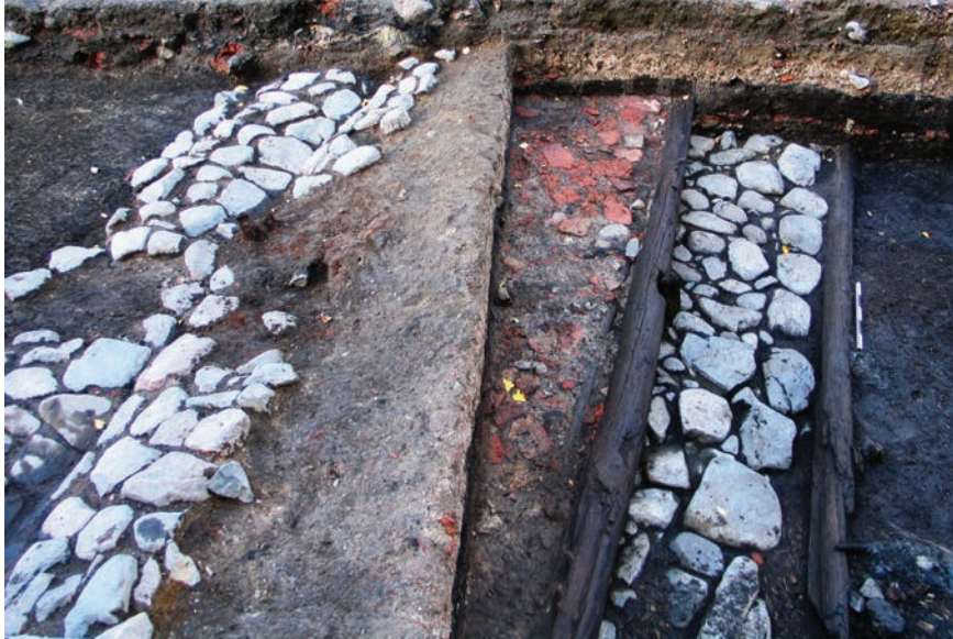
Fig. 7. The photo presents the stratigraphy of different pavements and phases of the School Square. In the oldest phase (on right), the square was provided with a stone paved lane framed with logs. In the next phase (middle), the lane was paved with bricks while the square remained unpaved. The square was paved with stones in the late 15th century or in the early 16th century (left).

102). This information has led to the conception that the squares of Turku were not paved prior to the 18th century. However, the archaeological excavations on School Square in 2005–2006 revealed that the square was paved with stones already during the late 15th or early 16th century when the paving of streets had become more common in Turku (Fig. 7). It is possible, that also the Market Square was paved in the late 15th or early 16th century, since this was the time when the streets in the central town area leading to Market Square were paved with stones. However, evidence about the surfaces and maintenance of squares of Turku can be achieved only with new archaeological excavations.