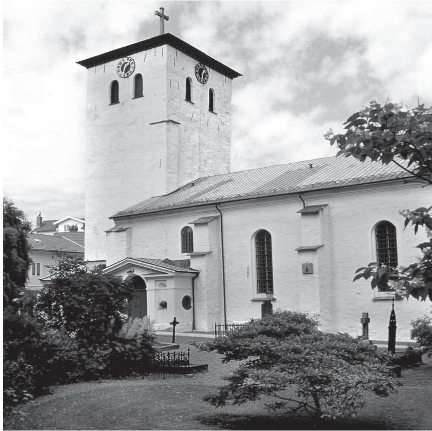
Figure 5. Mariakyrkan in Marstrand, facing northwest. The remains of the Franciscan friary partially excavated between 2017 and 2018 are located in the cemetery area on the left hand side of the photograph.

built something on Marstrand. The key question here is what he did build. For reasons that will be further developed in the following, I reject the idea of any town-like settlement on Marstrand before the turn of the 14th century. In my view, it is not until the second part of that century that there are somewhat clearer evidence of the existence of a town. However, even if one accepts that the town of Marstrand was formally founded by King Haakon, there is a need to explain what his build-